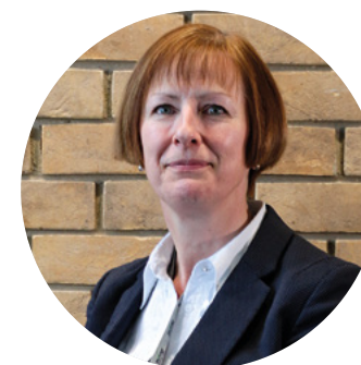
Clare Fletcher Estates